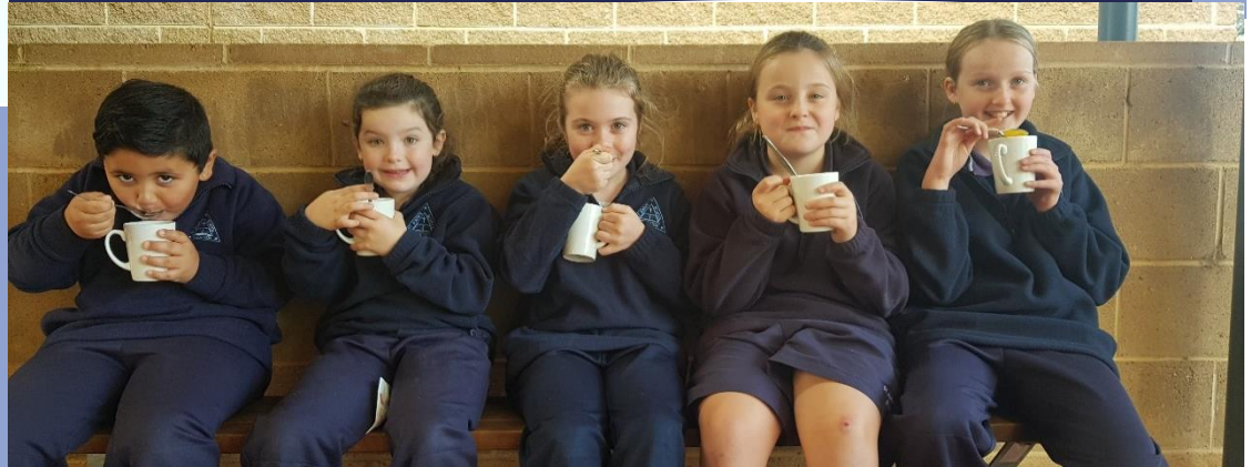
Students enjoy a cup of warm soup on a cold winters day provided by the St John's Lutheran School Parents & Friends

Term Two, Issue Eleven, Wednesday 30 June 2021