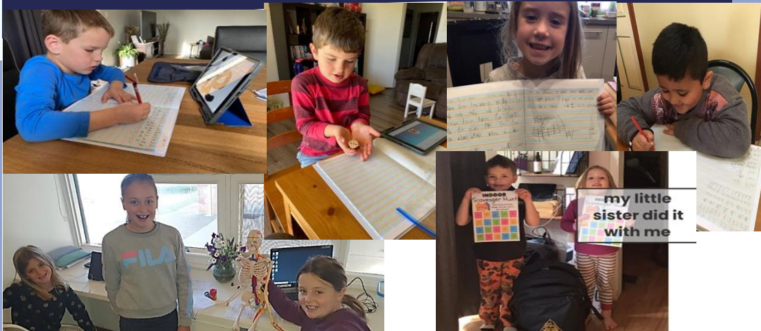
Students were required to undertake 'Learning from home' during the recent lockdown. Pictured here are some of our St John's Students in their 'at home classrooms'.