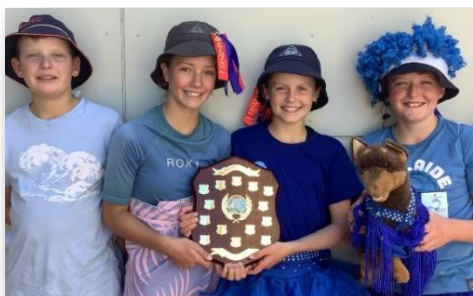
Captains and Vice Captains of 'Thiele' House Team who were presented with the Swimming Shield as overall winners of the Carnival

Additional thanks go to all staff and parents who had assisted on the day, with a special mention to the Parents and Friends for providing us with lunch. I also wish to comment on the terrific participation of the students who supported and encouraged each other throughout the day. Well done!