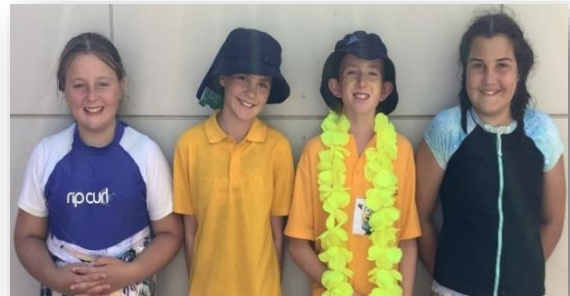
Captains and Vice Captains of 'Emmaus' House Team