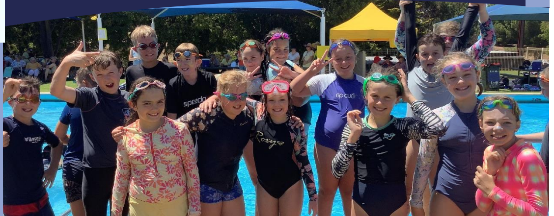
St John's students enjoyed perfect weather for the Swimming Carnival last Friday! Read all about it on pgs 4-5 of the newsletter.