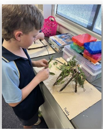
Nellie and Ella focus on creating a strong structure